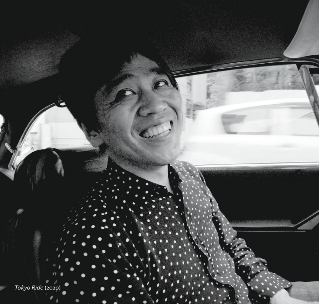
Tokyo Ride (2020)