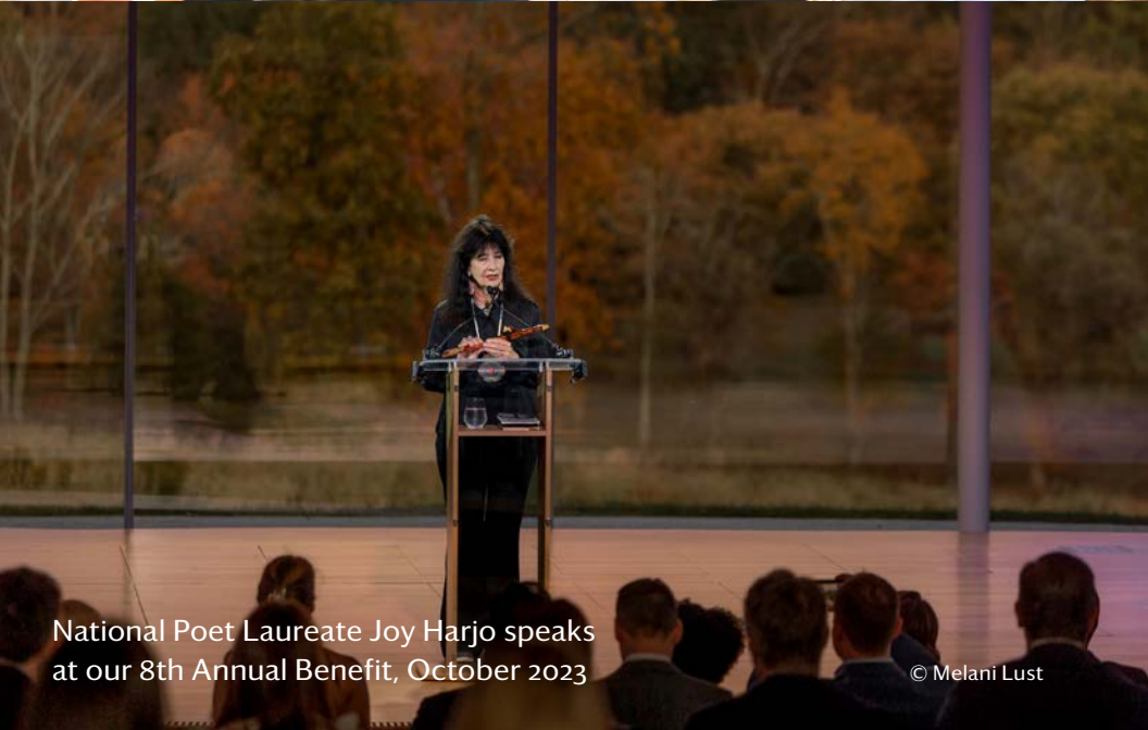
National Poet Laureate Joy Harjo speaks at our 8th Annual Benefit, October 2023

Becoming a member helps us advance our mission to pursue a more peaceful world and supports the preservation of the River building and its surrounding 80 acres.