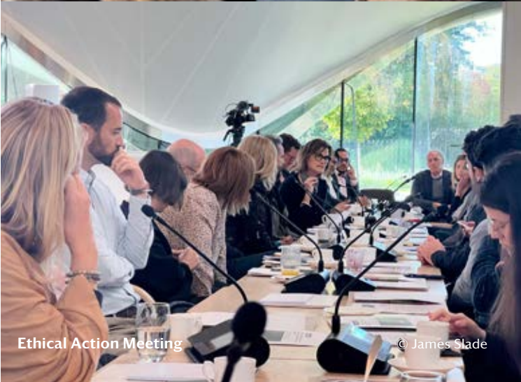
Ethical Action Meeting