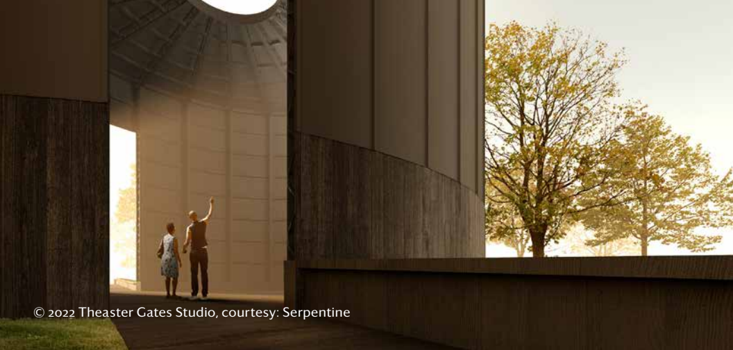
© 2022 Theaster Gates Studio, courtesy: Serpentine