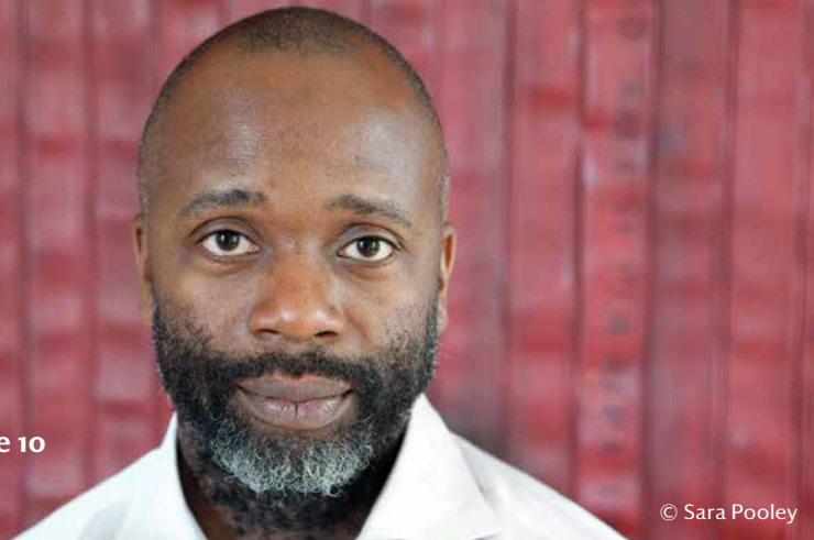
Theaster Gates Serpentine Pavilion Black Chapel by Theaster Gates Design for Freedom Pilot Project