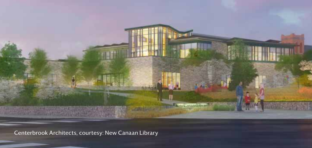
Centerbrook Architects